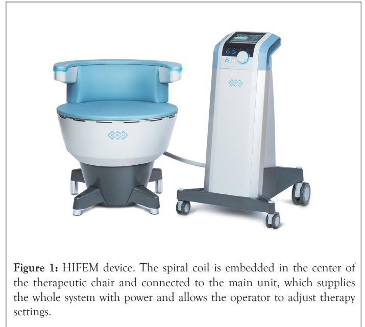
Figure 1: HIFEM device. The spiral coil is embedded in the center of the therapeutic chair and connected to the main unit, which supplies the whole system with power and allows the operator to adjust therapy settings.

to note that the lower the score the better QoL. The obtained results were compared to the baseline and statistically analyzed by a two-tailed paired t-test with the level of significance set as 5%. The Shapiro-Wilks test for normality verified the normality of data.